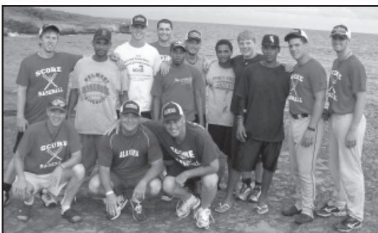
The 2010 SCORE International College Baseball Team